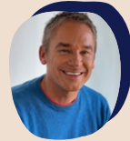
Marcus Buckingham, New York Times best-selling author and Co-Head of the ADP Research Institute